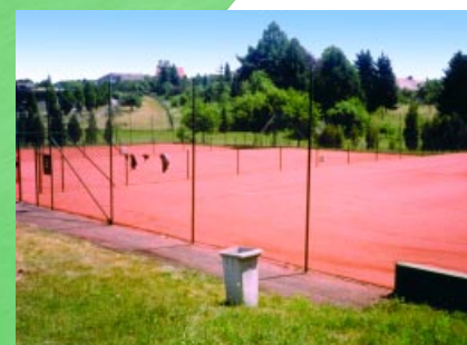
Classic Clay Court - Paris