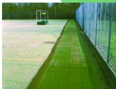
Before / After Extraction