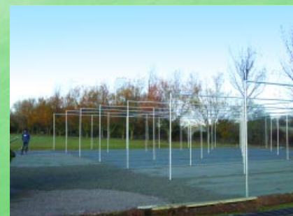
Installation of 6 bay Cricket cage for Lancing College