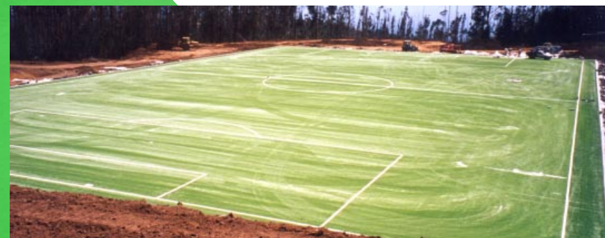
Sand filled Soccer Pitch - Madeira