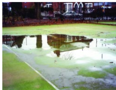
Before and after Rejuvenation of a Tennis Court