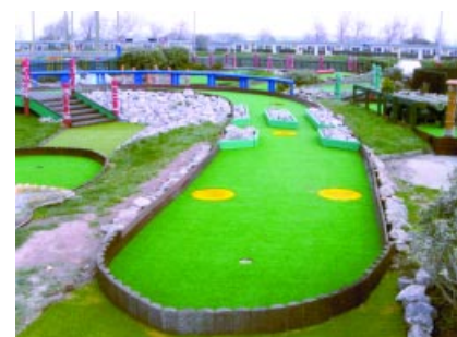
Crazy Golf Course at Pontins