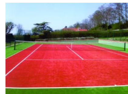
2 Tone Sand Filled Court