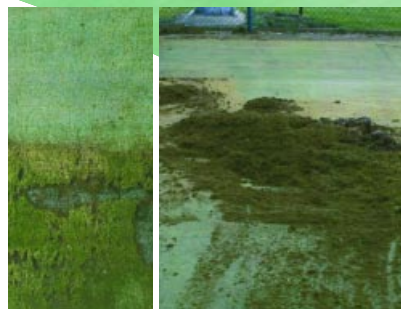
Build up of moss and contaminated sand

When H & A rejuvenates a surface we use our own machinery and staff, so you get 20 years of experience as well as benefiting financially.